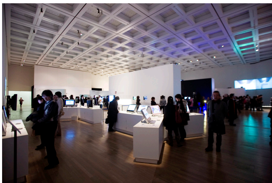
Images of the exhibition of the 13th Japan Media Arts Festival

Past award-winning works will be also presented in more than 30 festivals both at home and abroad, including Ars Electronica (Austria), ISEA (Germany), SIGGRAPH (the United States), Japan Expo (France) and International Animation Festival Hiroshima (Japan).