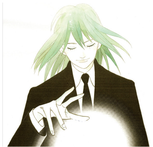
© 2007 Makoto Isshiki / THE PIANO FOREST Film Partners